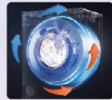
Hot And Cold Air Exchange