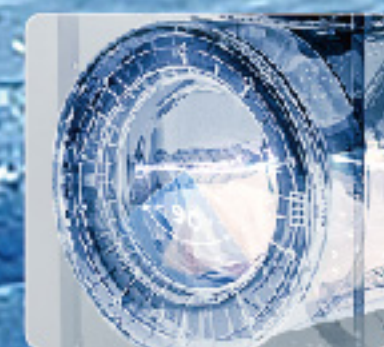
Wet Cleaning Function