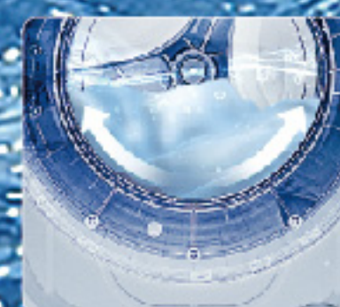
30 Kinds of Wash Programs